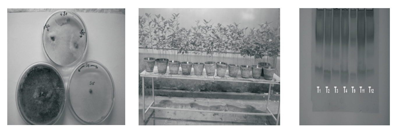
Figure 3: h. Antagonism by S_7 \& S_{12} against Pathogen ( S_{15} ) in a consortial manner, i. Effect of bio agents on plants after sowing under green house, j. Analysis of Pox in native PAGE 30 DAS.

the percent seed germination, seedling biomass on dry weight basis and seedling vigour on possible extent of the crop seeds used. Among two forms of formulation the charcoal based seed treatment with respective bio agent singly or in compatible combination along with seed treating chemicals gave better responses with respect to enhanced germination of seed.